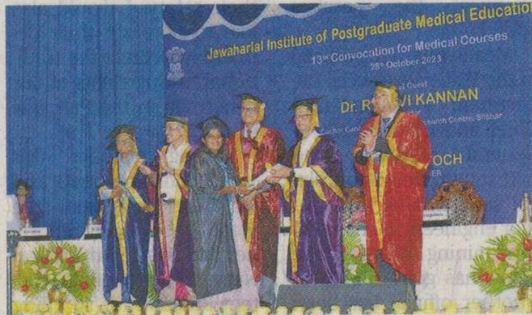
Students of the JIPMER receiving degree certificates at the convocation.

"Research need not necessarily imply cutting-edge developments. A lot of research involves what is observed and analysed," said