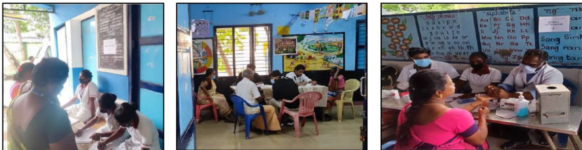
Fig.: A few glimpses from the camp

A total of 251 individuals attended the camp of which majority were in the age group of 46 – 60 years (39.80%), followed by 19 – 45 years (31.94%), 5 – 18 years (17.13%), more than 60 years (8.36%), and under 5 years (2.78%). Among the attendees, 68.92% were female and 31.07% were male. Hemoglobin was measured for seventy-one attendees. Random blood glucose of 188 attendees were measured, out of which 33 (13.14%) had abnormal values of \geq 200 mg/dl and were advised dietary modifications and importance of adherence to treatment. Medicine department had the most consultations followed by Ophthalmology, ENT and Dermatology. Ophthalmology team screened persons with diabetes and hypertension for complications, screened many individuals positive for cataract and referred for cataract surgery and those with decreased visual acuity were provided with prescription for spectacles.