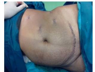
Port sites and retrieval incision in an obese donor